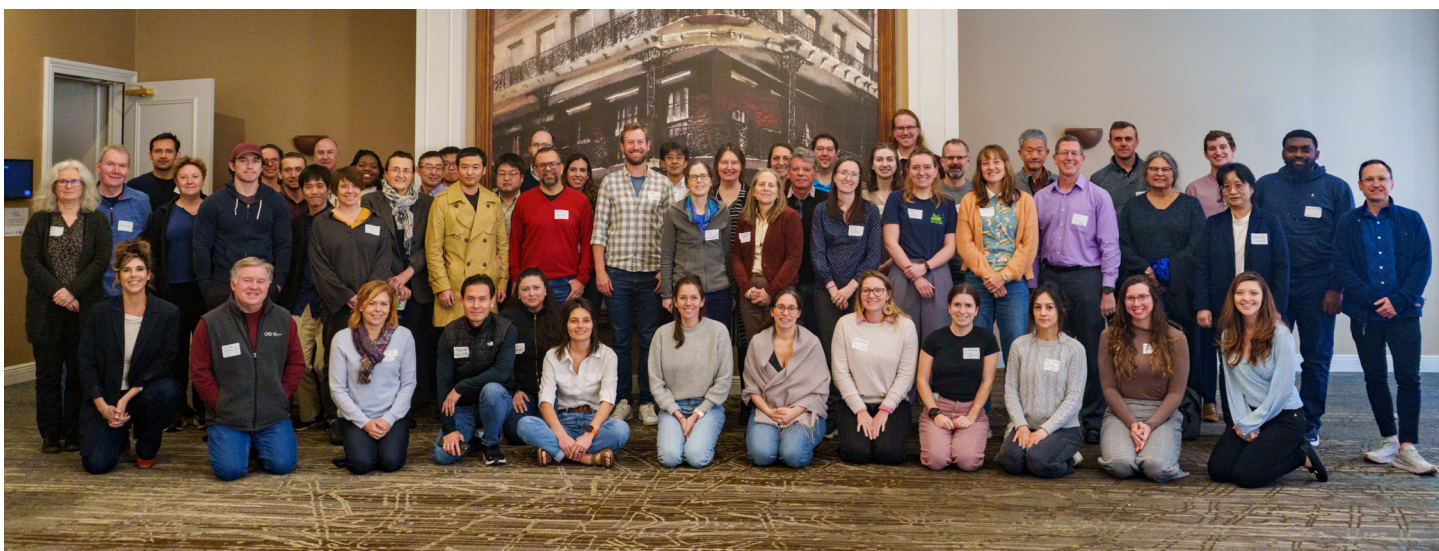
Attendees at the OASIS Face-to-Face Meeting, February 2024.